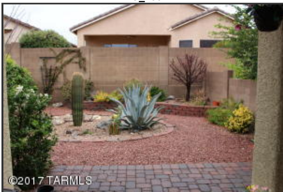
Private, Well Manicured Backyard