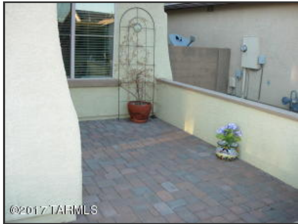
Stone Paver Courtyard