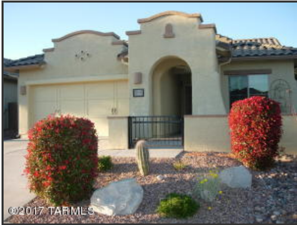
1106 W. Montelupo Dr.