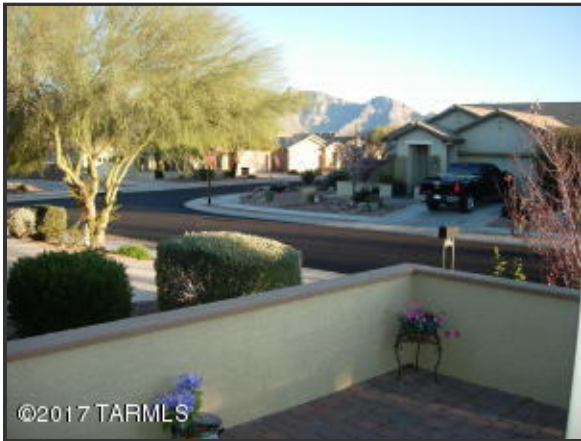
Catalina Mountains from the Courtyard.