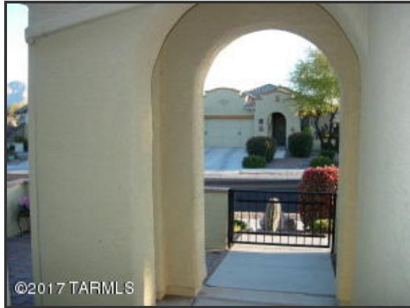
Looking South from Front Door